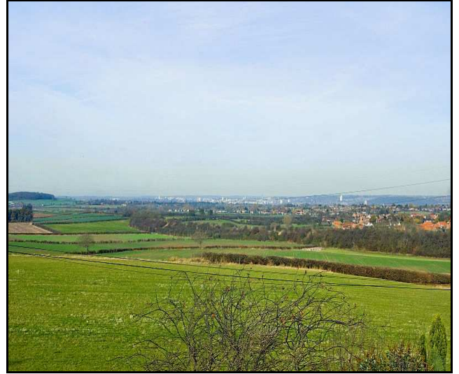
Photo of view from plot