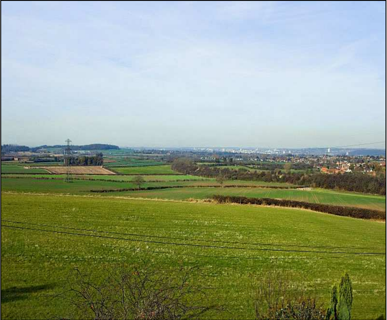
Photo of view from Plot

Single Building Plot Adjoining Meadowside, Park Road, Plumtree Park, Keyworth, Nottinghamshire, NG12 5LX