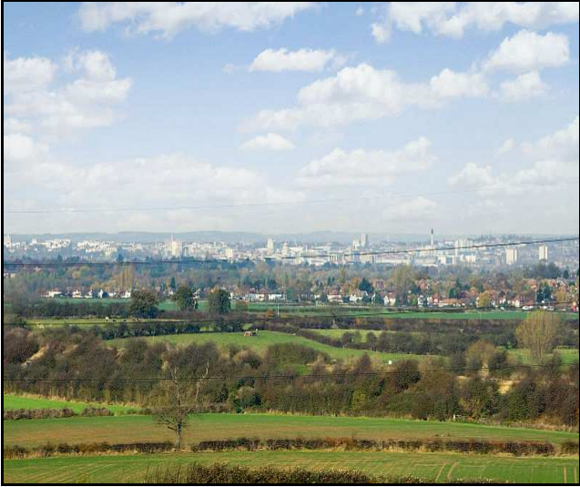
Photo of view from plot